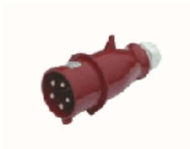
IEC60309 plug (32A 3P+N+E)