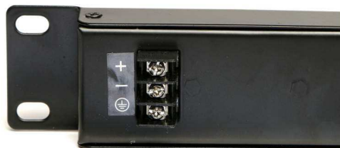
secondary wired DC input with ground