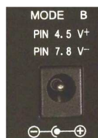
2.1mm DC input