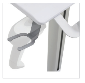
All SV10 carts include an integrated scanner holder

Spacious worksurface holds any Surfacetablet with extra area for a mouse or other task-related items