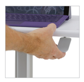
Integrated hand-brake secures platform height to provide an ultra-stable worksurface