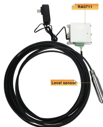
Figure2 RA0711 renderings (subject to the actual object)